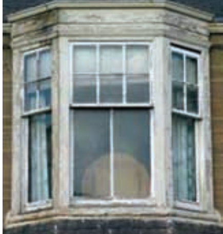
Deteriorating paint leaves timber vulnerable to decay