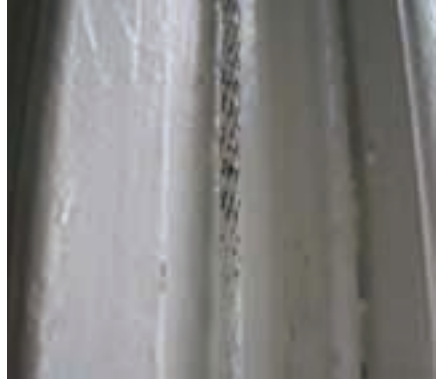
Paint-covered sash cords will make the window more difficult to open and close

Sash windows can usually be repaired with relative ease, and regular maintenance will prolong their life by many years. Modern timber can rarely