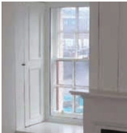
Secondary glazing can be effective and unobtrusive