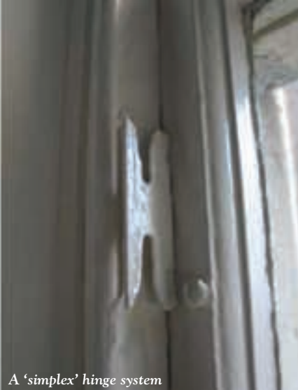
A 'simplex' hinge system