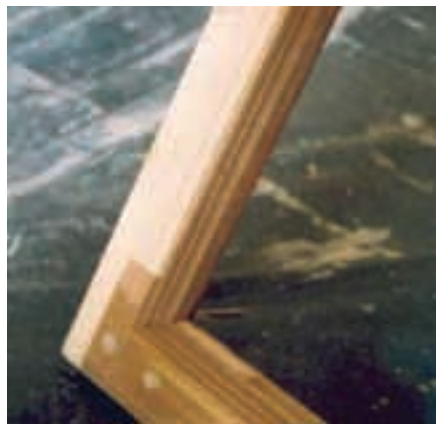
New timber can be used to replace rotten sections

Where decay is localised it is possible to splice in new timber, though care should