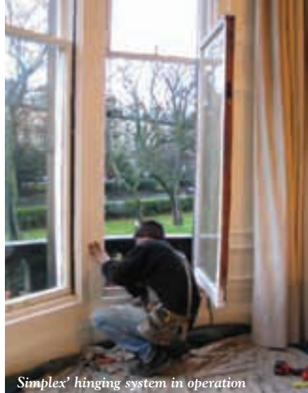
'Simplex' hinging system in operation

possible. Broken ironmongery can often be repaired. Where it has been obscured by thick over-painting, the paint should be removed without too much difficulty.