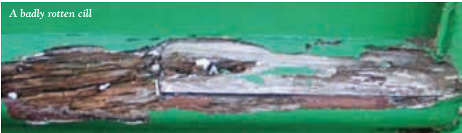
A badly rotten cill

Where paint breaks down, the timber parts are directly exposed to the weather and become vulnerable to decay. Rot is often localised however (the cill is usually the area most prone to decay), and in the majority of cases it is straightforward to repair. If tackled early, this will minimise the amount of material that needs to be replaced. Repainting is also essential to give the window better protection.